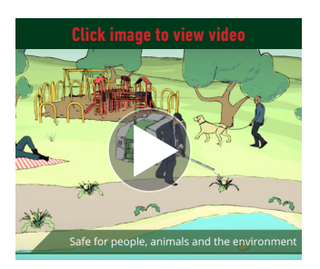
Foamstream process video