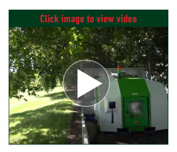
Weedingtech promotional brand video