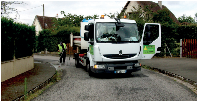
Treating around residential road edges.